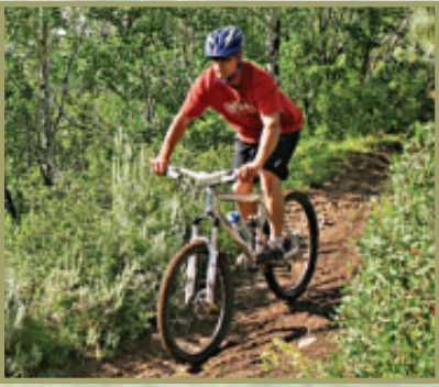
Mountain biking our trails.