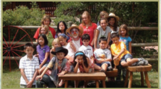
Everyone that wants to take a nap - raise your hand!

Nothin' better than a campfire with s'mores.