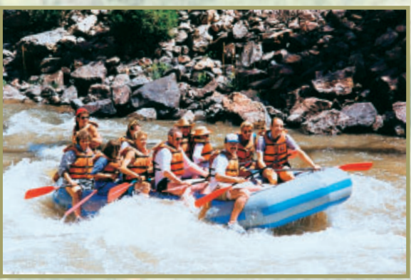
River rafting adventures on the Colorado River.