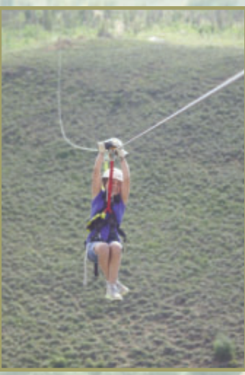
Zipline thrills over the ranch.