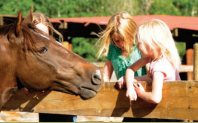
Farm animals and children are made for each other.

A t Drowsy Water Ranch we treat your children as we do our own - with understanding, patience, love and respect. Our counselors and program supervisors are young adults selected for their experience, attentiveness and interests in child development and recreation. Programs, activities and horseback riding are planned for every age group - 5 and under, 6 through 13 and for teenagers. Supervised programs even include infants.