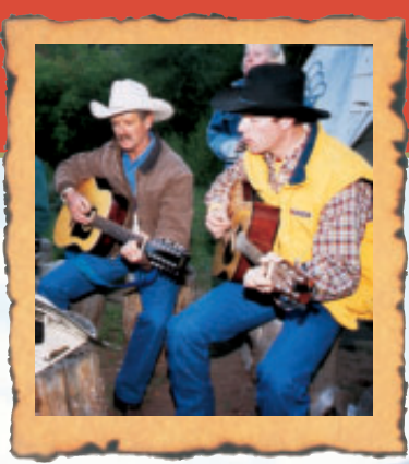
We make our own evening entertainment. Campfire sing-a-longs, country dancing, old fashioned melodramas, carnival night and more.

D o as much or as little as you like. Here at Drowsy Water, we offer opportunities for a variety of mini-adventures that complement the ranch vacation experience. But most important to us, we want you to relax, refresh and to un-stress. After all, that's what a vacation is all about.