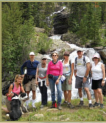
Hiking in the Rockies