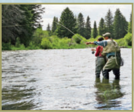
Trophy trout fishing - a cast away on the Colorado River.