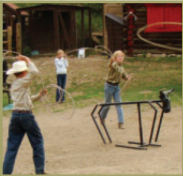
Practicing for the rodeo.

Riding instruction, nature hikes, cook-outs, story telling, fishing, exploring our kids' fort, crafts and the heated swimming pool are just some of the favorite things kids love to do.